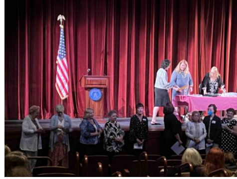
Acknowledging all the Presidents in the District.