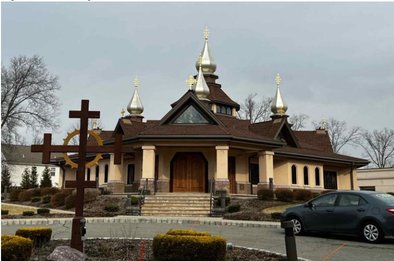
Beautiful Ukrainian church at UACCNJ.

At this time, we will ONLY be accepting aid deemed to be most critical: military and medical items. We have created an Amazon wish list, which contains these high-priority items that Ukraine needs at this time. When ordering items on Amazon, please use the UACCNJ address as the destination. (Go to the website to connect to UACCNJ Amazon wish list or to donate, as well as to find more information of where to donate. The website has been built up very well.